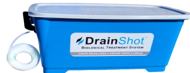
Portable Size: 24"L x 12"H x 12"W

Mix thoroughly prior to dosing. To refill system, disconnect 10L reservoir from tubing. Add water to reservoir first (about 2/3rd's full) THEN add bio treatment concentrate. Swirl to mix.